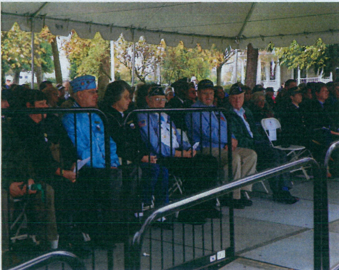
K.W.V.A. Was well represented