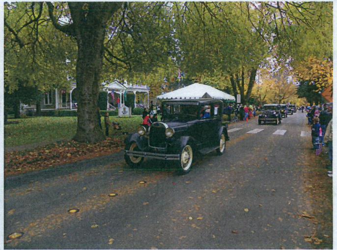
Flying Eagle "A" Model A Club