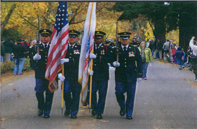
I Corps Color Guard

It was a good day for the VETERANS DAY PARADE. Not hot, not cold, not wet and the Sun did not hurt your eye's. There were approximately 2500 people involved with 120 units for the parade. There were many Boy Scout troops present and the R.O.T.C. units were well represented.. They drew a lot of applause from the by-standers.