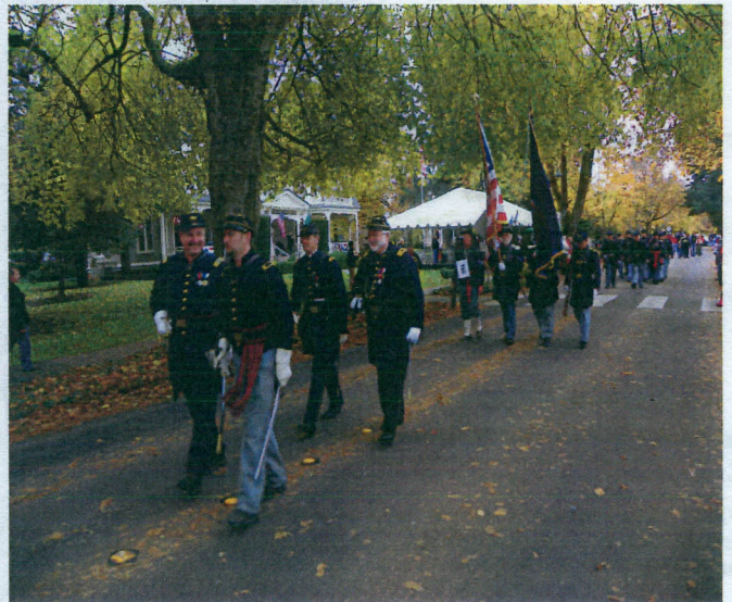
1st Oregon Volunteer Infantry