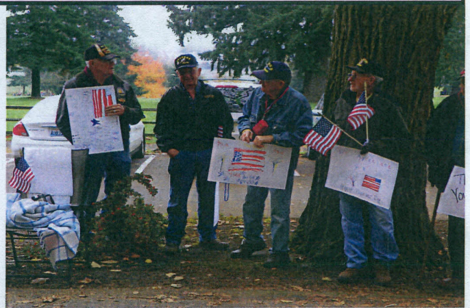
K.W.V.A. # 321 Members