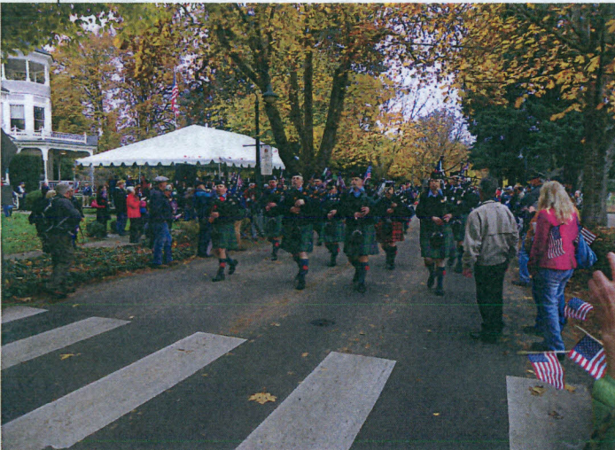
Fort Vancouver Pipe Band